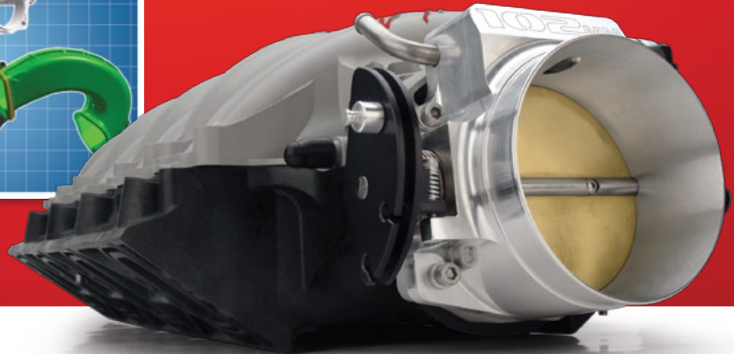
#146102 Shown with #54103

FAST™ engineers teamed up with airflow specialists at RHS™ to develop polymer intake manifolds for rectangular port GM LS3-type and LS7 engines. Testing on a stock LS7 engine with a Big Mouth 102mm Throttle Body™ produced gains of 16+ horsepower and 26+ rear wheel horsepower with a 500c.i. engine. The LSX R ™ 102mm Intake Manifold features a multi-layer modular design that allows easy disassembly and porting. Extensive testing led to a runner design that is longer and less restrictive and gives the user the ability to remove individual runners from the manifold for modification.